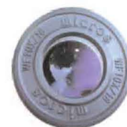
Eyepiece Widefield WF10x/18 To make communication much more effective