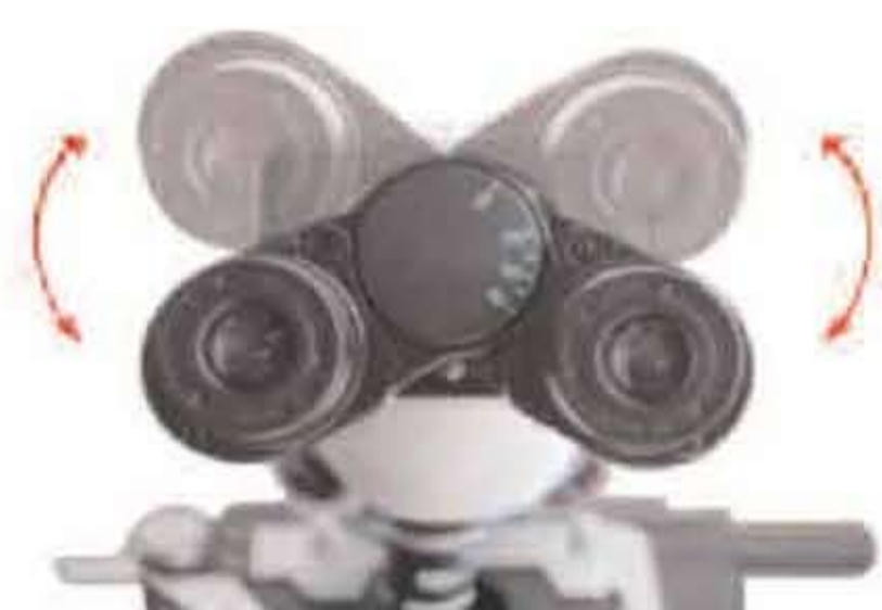
Binocular Archtype Siedentopf Head Inclined at 30° Interpupillary Distance 48-75mm